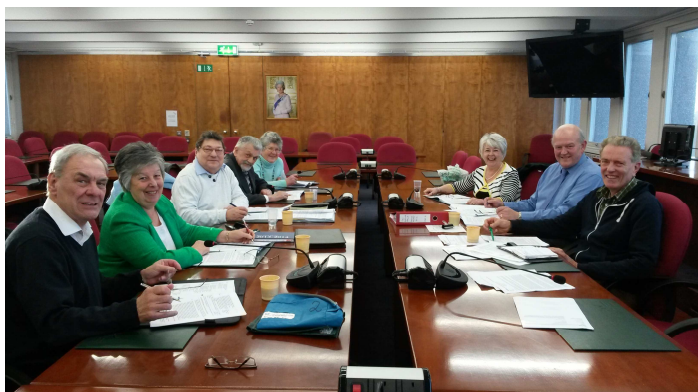
Members of the Working Group on the Francis Report.